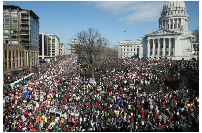
It has been reported that over 185,000 people visited the capital to welcome home the Fabulous 14 Democratic State Senators.