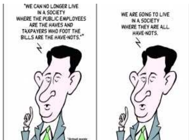
Sounds like Ziegelbauer. He calls teachers the privileged class.

The Manitowoc School District is reducing staff by about six teachers for the 2011-2012 school year and slightly raising class size due to cutbacks in state aid. In addition to this the district must make even more cuts in order to keep next year's tax increase as low as possible. [18 teachers are retiring – up from previous years.] ■